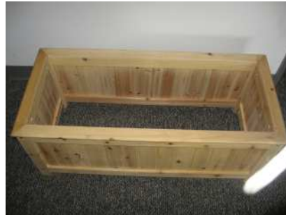
Fig. 3 Four sides completed

2. After setting up the main frame, use the cedar bottom piece (Or 2 if you purchased a rectangular model) to install the bottom of the planter as shown in Fig. 4. For stronger support, you can staple, nail, or screw the bottom in if necessary.