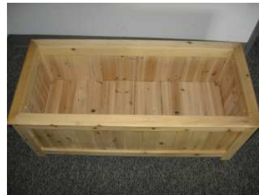
Fig 4. Bottom fitted in and completed

2. After setting up the main frame, use the cedar bottom piece (Or 2 if you purchased a rectangular model) to install the bottom of the planter as shown in Fig. 4. For stronger support, you can staple, nail, or screw the bottom in if necessary.